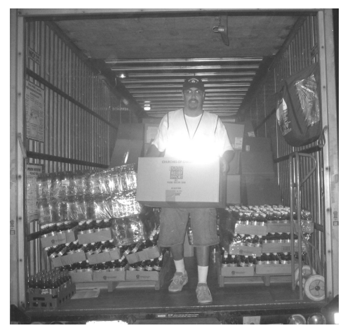
Potrero VFD volunteer wearing Blackwater hat carries boxed relief to sustain a family of four for four days as truck is unloaded in Potrero.

This shortage of relief supplies in Potrero was quite remarkable since other areas had long completed distributing their supplies. One could only wonder if the shortage allowed to continue so Blackwater could become the valiant white knight saving the town from the ravages of the disaster, indeed just days prior to the mailing of the ballots in the