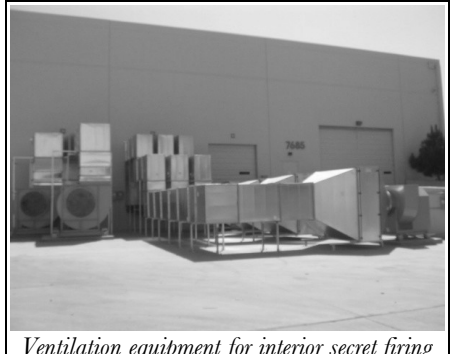
Ventilation equipment for interior secret firing range of "vocational school".

The name "HomeTex" was on the front of the building within a few doors of the Cal-Mex border and two doors from the U.S. Border Patrol Otay station. At 61,000 sqft, the building had twenty loading bays on one side and in