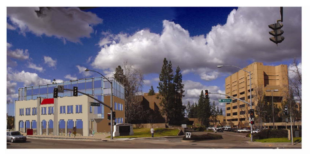
Rendering of the new El Cajon Conference Center facility.