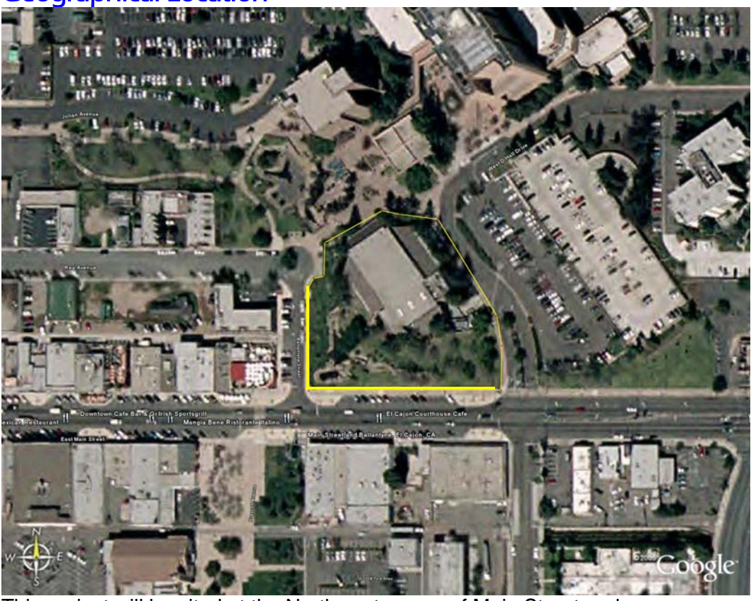
This project will be sited at the Northwest corner of Main Street and W. D. Hall Drive as outlined above.