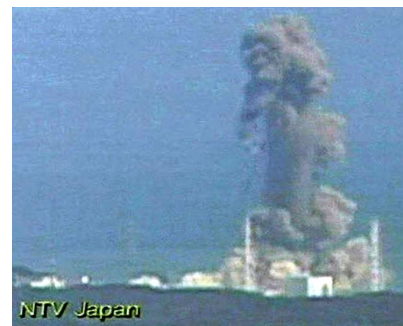
At Fukushima Japan? (Still in full meltdown since March 11, 2011)