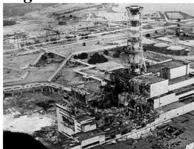
Chernobyl Meltdown: 26 years ago (April 26, 1986)

And the worst of all: Fukushima, Japan 1 year ago (March 11, 2011) 3 nuclear cores in full meltdown + 7 cores in unstable leaking fuel pools!