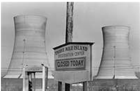
Three-Mile Island Disaster: 33 years ago (March 28, 1979)

→ Just South of San Onofre Nuclear Generating Station Commemorate the continuing nuclear disasters: