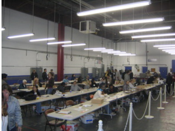
Incoming Inspection Area at Tally Center